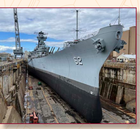
Battleship New Jersey Dry Dock

The Historic Preservation Continuing Education Program at Rutgers University-Camden was launched in 2016 through a partnership between the New Jersey Historic Trust and the Mid-Atlantic Regional Center for the Humanities (MARCH). Designed for those who desire to gain a deeper understanding of the vocabulary and discipline of historic preservation, students learn from professionals working in the field to gain a more realistic perspective on how the tangible remains of our past can be integrated within current environments. In 2017, the program began offering a Certificate in Historic Preservation, and in 2023 the program presented two full semesters of courses. For more information, visit: www.preservation.rutgers.edu.