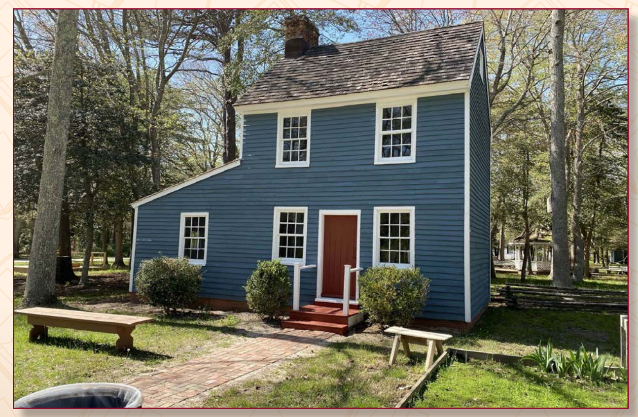
Historic Cold Spring Village Historic District