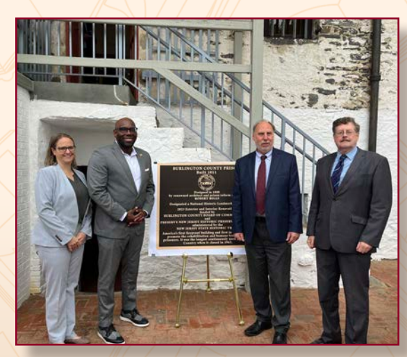
Burlington County Prison Museum

Throughout the year, the New Jersey Historic Trust staff helps plan and supports educational workshops and conferences that reached the history and historic preservation audiences. In 2024, the Trust participated in several events including the New Jersey Governor's Conference on Housing and Economic Development, New Jersey Conference on Tourism, New Jersey League of Municipalities Conference, Middlesex County History Day, and Washington's Landing. In addition, New Jersey Historic Trust staff and board members regularly attend events that celebrated a project's milestones, such as a ribbon cuttings or groundbreakings. This year, the Trust celebrated ribbon cutting and groundbreaking ceremonies at the Burlington County Prison Museum, Craftsman Farms, and Franklin Street School.